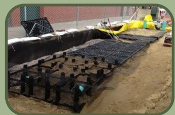
Silva Cell™ - Burlington