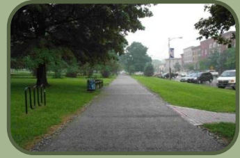
Pervious Pavement - St. Albans