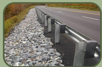
Roadside Curb Removal – Route 9