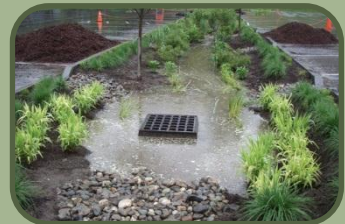
Bioretention - Montpelier